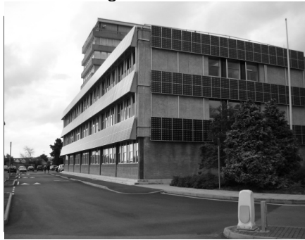
Photovoltaic panels saving North Devon County Council money on the Barnstaple Civic Centre's electricity bills

Step Three : presentation of nuclear power as a done deal, hoping people will feel there is no point in protesting about the dangerous waste we will leave for our grandchildren